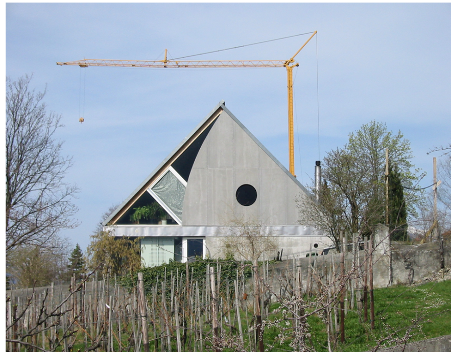
Küche (oben), Ostfassade (unten)